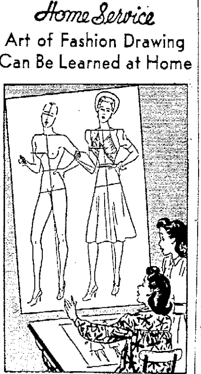
Charts Help You Draw Figure.

Do you wish you had enough talent to draw fashions? Perhaps you have! A few clear charts can take a little drawing ability a long way, as many a successful fashion artist can tell you. And you can learn a lot at home.